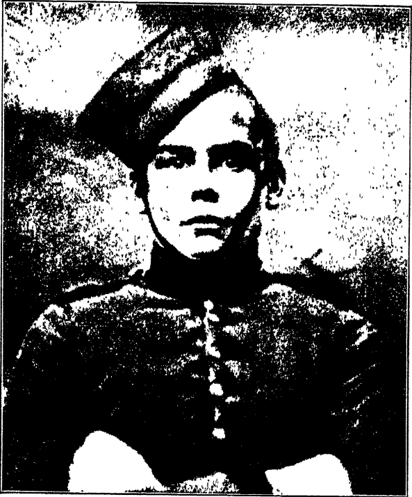
PRIVATE, 7TH DRAGOON GUARDS. AGED 20